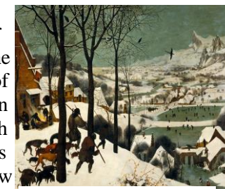
The Hunters in the Snow, 1565

Pieter Breughel the Elder was the greatest painter of Dutch and Flemish Renaissance painting in the 16 th Century. His landscapes and scenes of peasants, of the ordinary day to day activities in village life were in great demand by his patrons, notably wealthy Flemish Merchants. His paintings show this affinity for his subjects in these detailed depictions of a way of life now gone but with people just the same as today