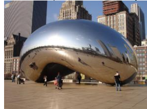
Wildenstein New York