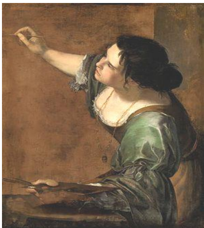
Self Portrait as the Allegory of Painting 1638-1639