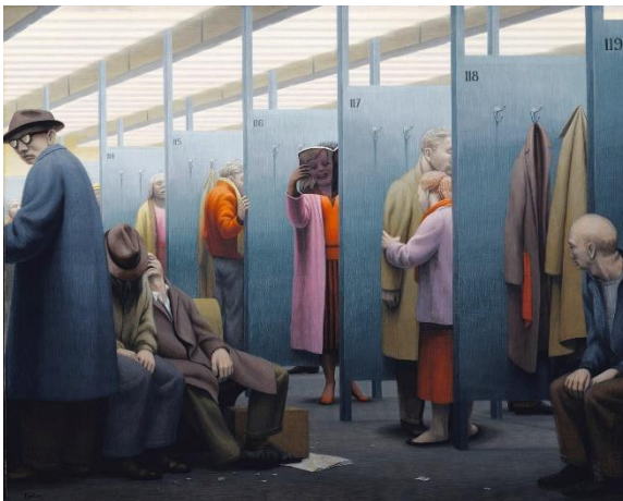
George Tooker – The Waiting Room - 1959

This overview of American Realist Art from the late 19th Century onwards includes celebrated images by Edward Hopper, Grant Wood and Andrew Wyeth ; also examined are George Tooker the 'Poet of American post-war anxiety', and Archibald J Motley, African-American Chronicler of Harlem society . lesser known but with no less remarkable talents.